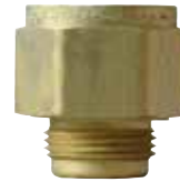
7572C-14A For Transfer Valves