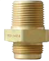
7572C-15A For Globe and Angle Valves